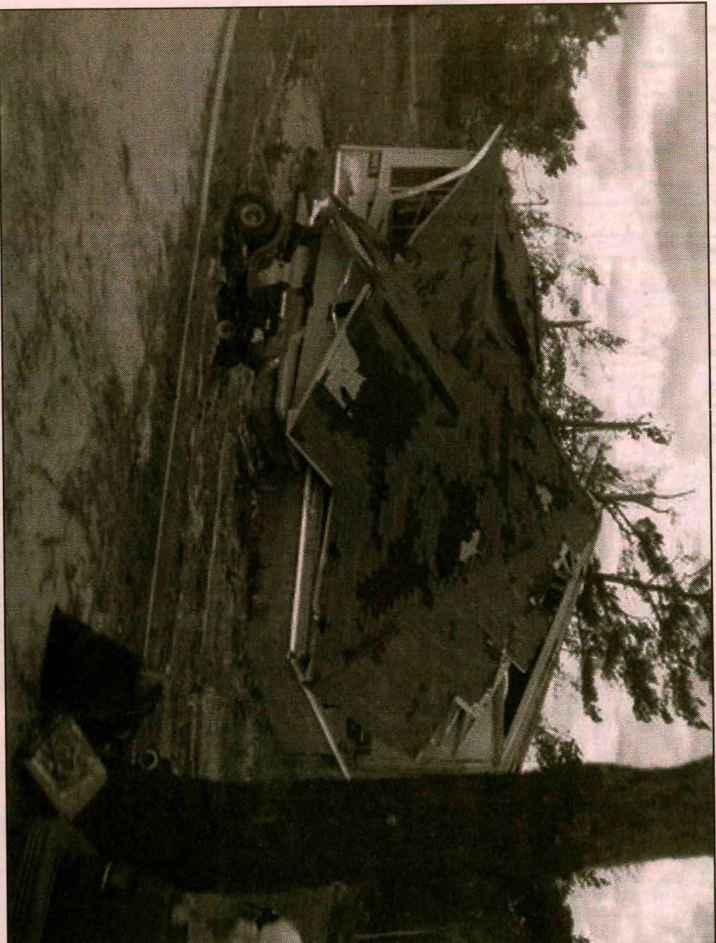
Left, an unidentified Huard soldier talks on his cell phone from the site of a mobile home that was destroyed in the Choctaw community of Choctaw County by the tornado. Above, the roof of this home in Choctaw County was lifted off the structure during the tornado.